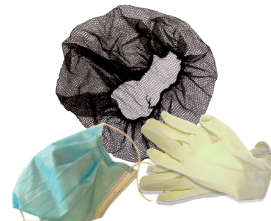
Disposable Gloves, Hairnets