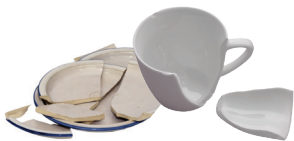
Broken Glass & Dishes (Please Wrap)