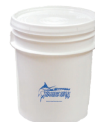
Large Plastic Tubs