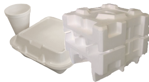
Polystyrene Foam & Packaging