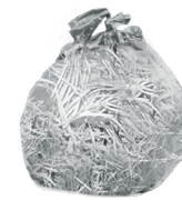
Shredded Paper (Must be bagged in a clear bag)