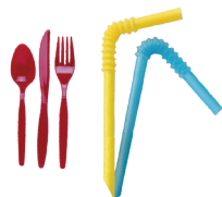
Plastic Utensils, Plastic Straws & Cup Lids