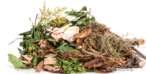
Grass, Weeds, Green Plants, Tree Limbs, Wood Chips, Dead Plants, Brush, Garden Trimmings, Leaves