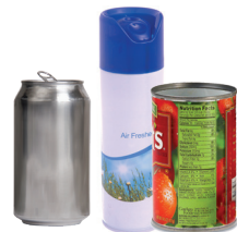
All Metal Beverage & Food Cans, Aerosol Cans