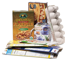
Food boxes, Paper Egg Cartons