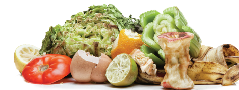
Unpackaged food waste such as: fruits, vegetables, grains and bread, eggshells, cooked meat and bones