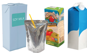
Beverage Boxes & Pouches (Multi-material Packaging)