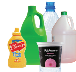
Empty Plastic Bottles & Rigid Plastic Containers #1, #2 and #5 only