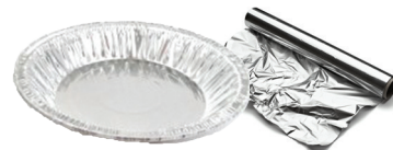
Aluminum Pans & Foil