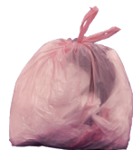
Bundled Plastic Bags & Films