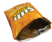
Snack & Chip Bags, Candy Wrappers