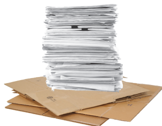
Office Paper, Magazines, Newspaper, Cardboard, Junk Mail