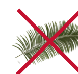
NO DIRT, ROCK, SOD, PALM FRONDS, CACTI, ICE PLANT OR SUCCULENTS