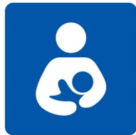
International Breastfeeding Symbol

The resources listed in this guide are for your information in making your health care decisions. Every effort has been made to offer complete and current listings. (Revised 6/22)