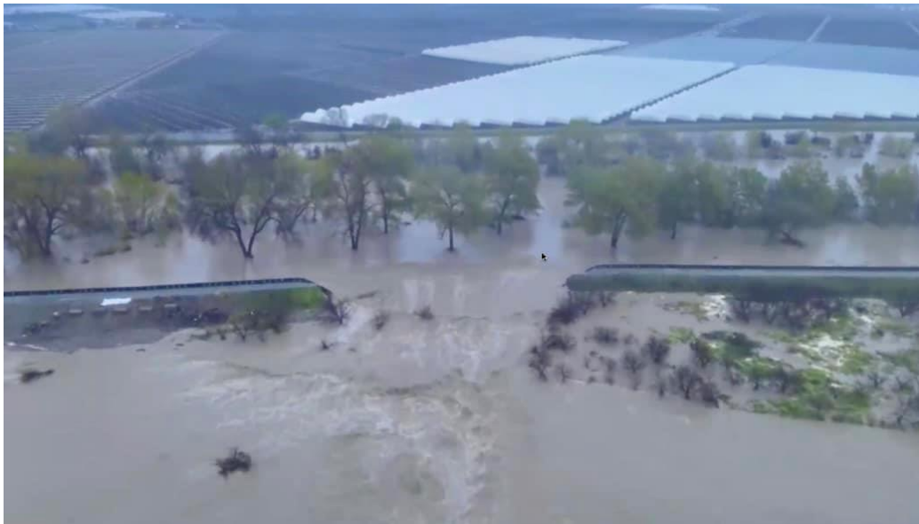
Figure 1: Levee Breach in Pajaro, CA caused catastrophic damage to homes on March 11, 2023

The effects on the population of Monterey County remain significant as the county is also considered highly vulnerable to recent disaster impacts, ranking in the 82 nd percentile for overall social vulnerability. Because the impacted communities have a relatively low median household income and a high percentage of renters, many individuals and households are subject to an increased vulnerability to displacement.