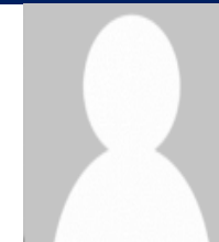
Vacant Public Sector Representative