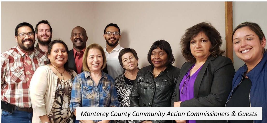
Monterey County Community Action Commissioners & Guests

Goal 6: Low-income people, especially vulnerable populations, achieve their potential by strengthening family and other supportive systems. (Family Level)