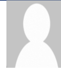
Vacant Public Sector Representative