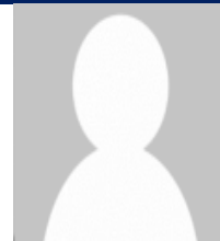
Vacant Low Income Representative