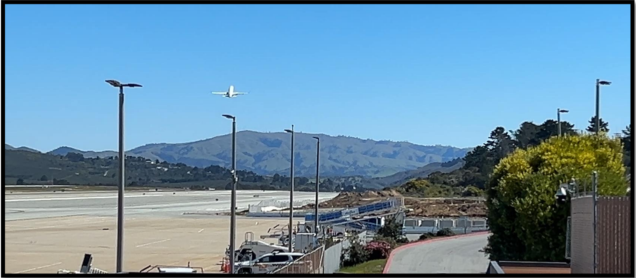
Commercial aircraft takes off over Canyon del Rey neighborhood.