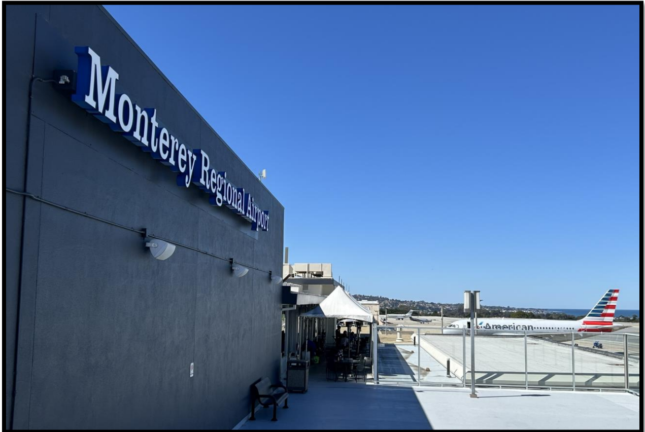
Commercial aircraft deplanes on tarmac with Monterey neighborhood in the background.

terminal is also designed to provide an electric system for recharging aircraft. This will eliminate the noisy, diesel-powered vehicles currently used for this vital purpose.