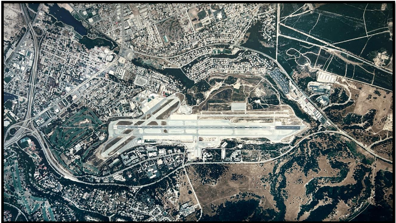
Aerial photography on display at Monterey Regional Airport.

MPAD has a distinguished history of providing the Monterey Bay area with a variety of services responsive to our community's air transportation needs.