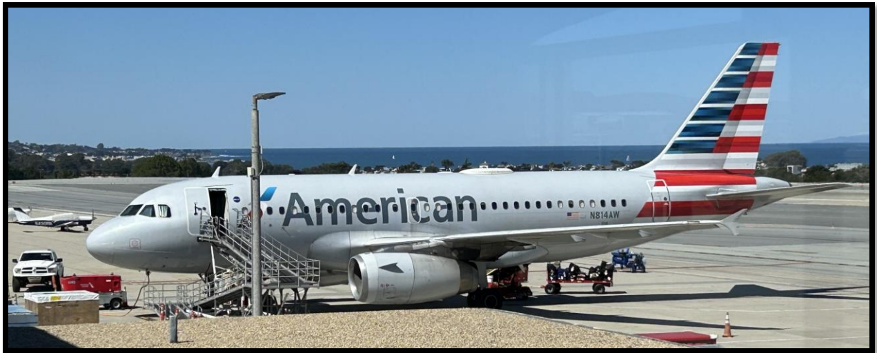
Commercial aircraft awaits servicing on the tarmac with North Monterey neighborhood and the Monterey Bay in the distance.