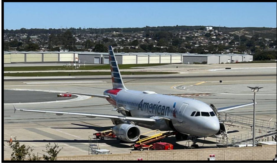
Commercial aircraft deplanes at gate with North Monterey neighborhood in the background.