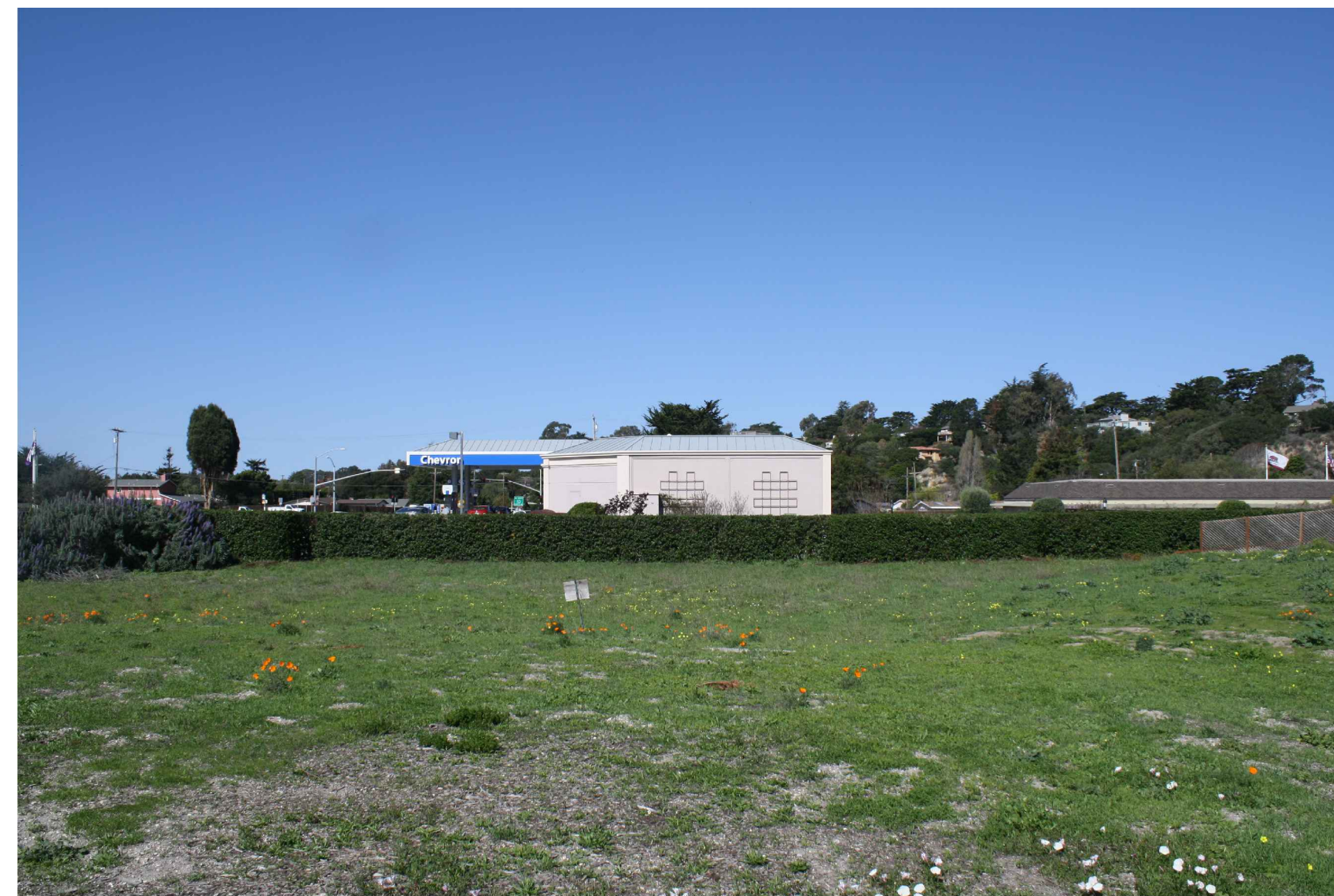
A-4 LOOKING NORTHWEST