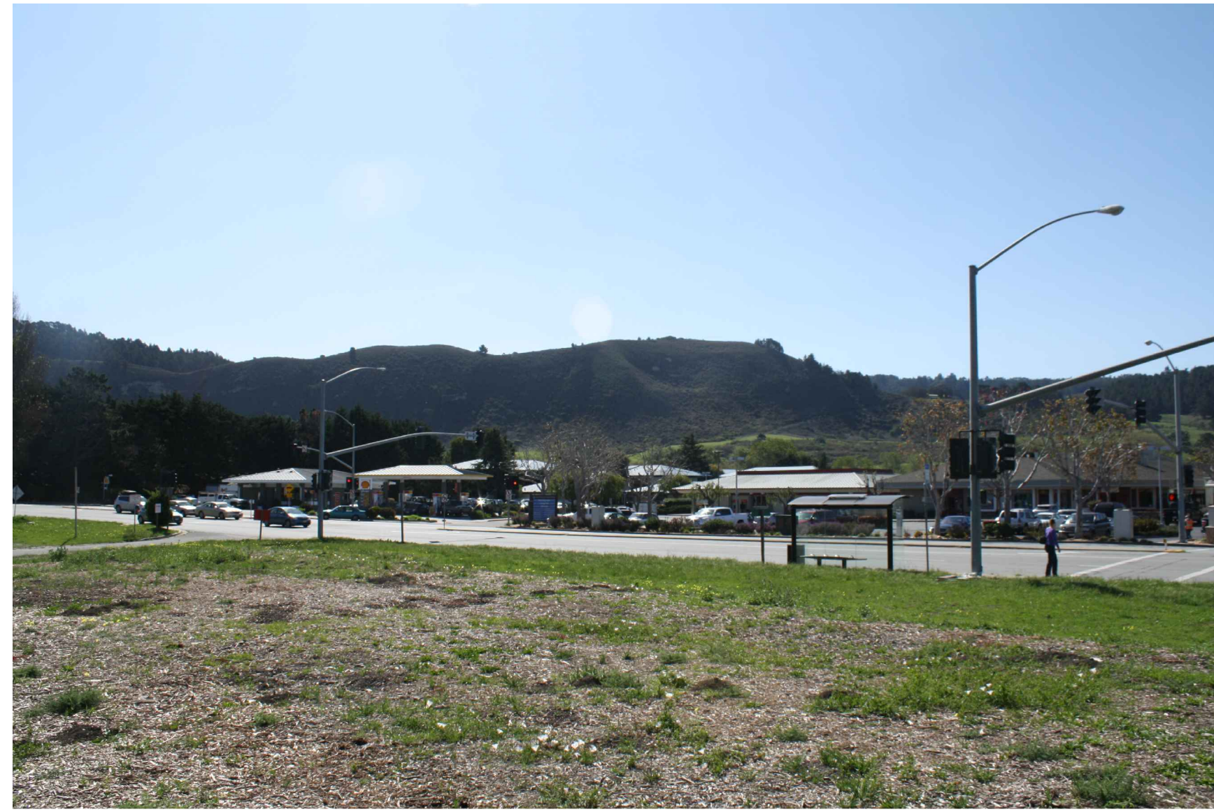
A-1 LOOKING SOUTHEAST