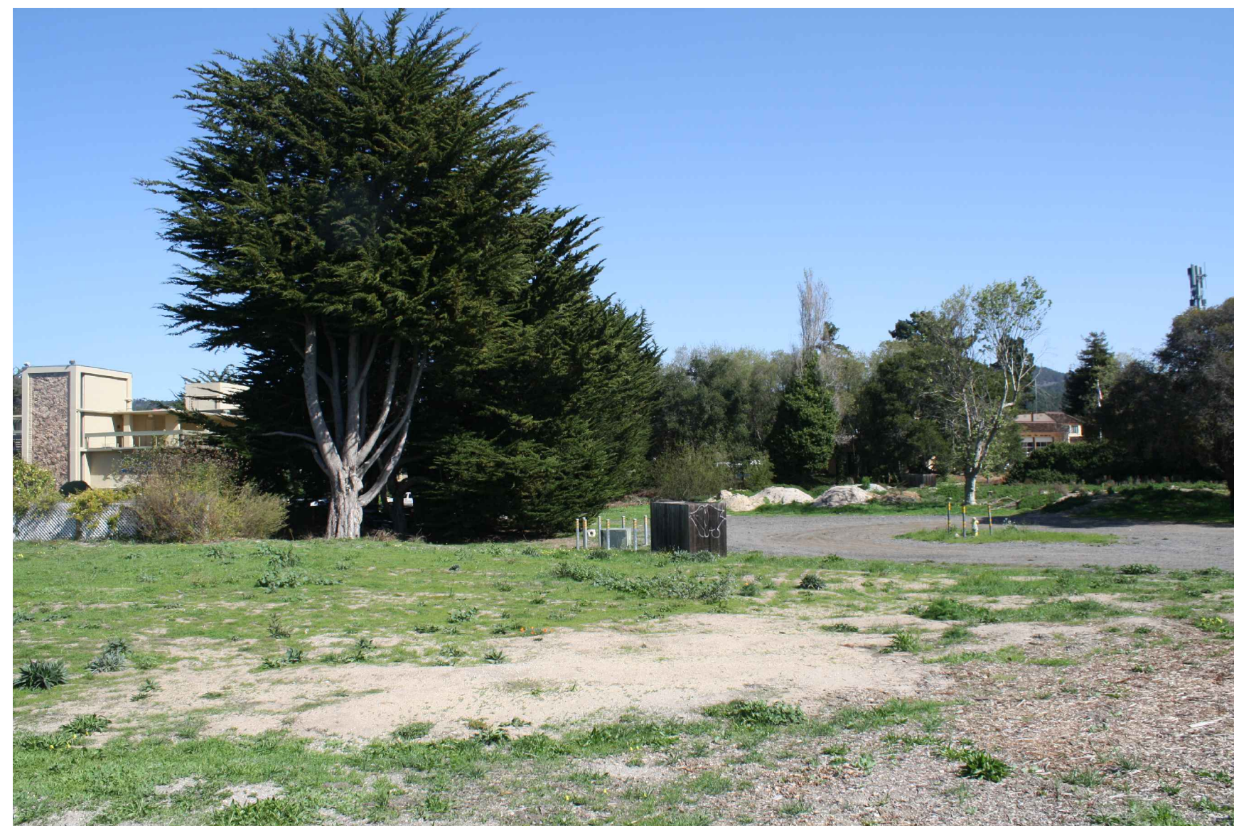
A-5 LOOKING NORTHEAST