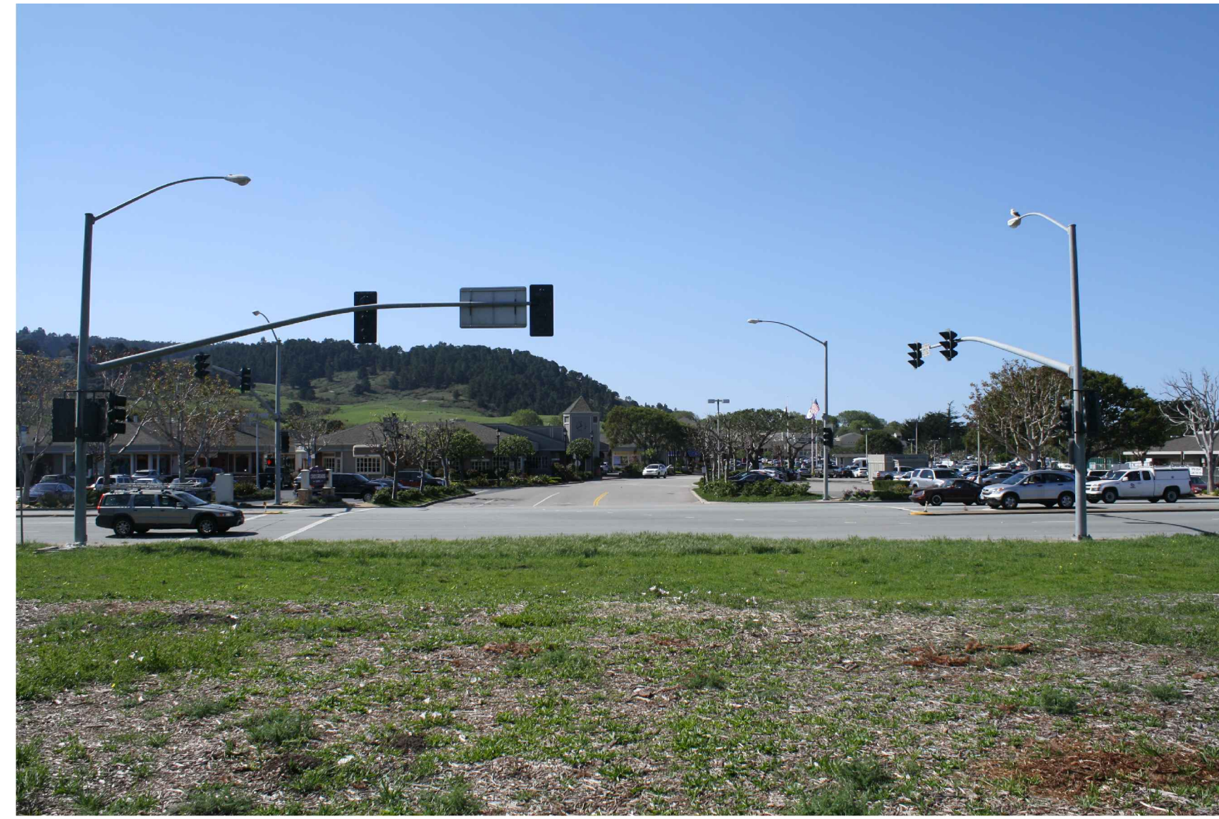
A-2 LOOKING SOUTHWEST