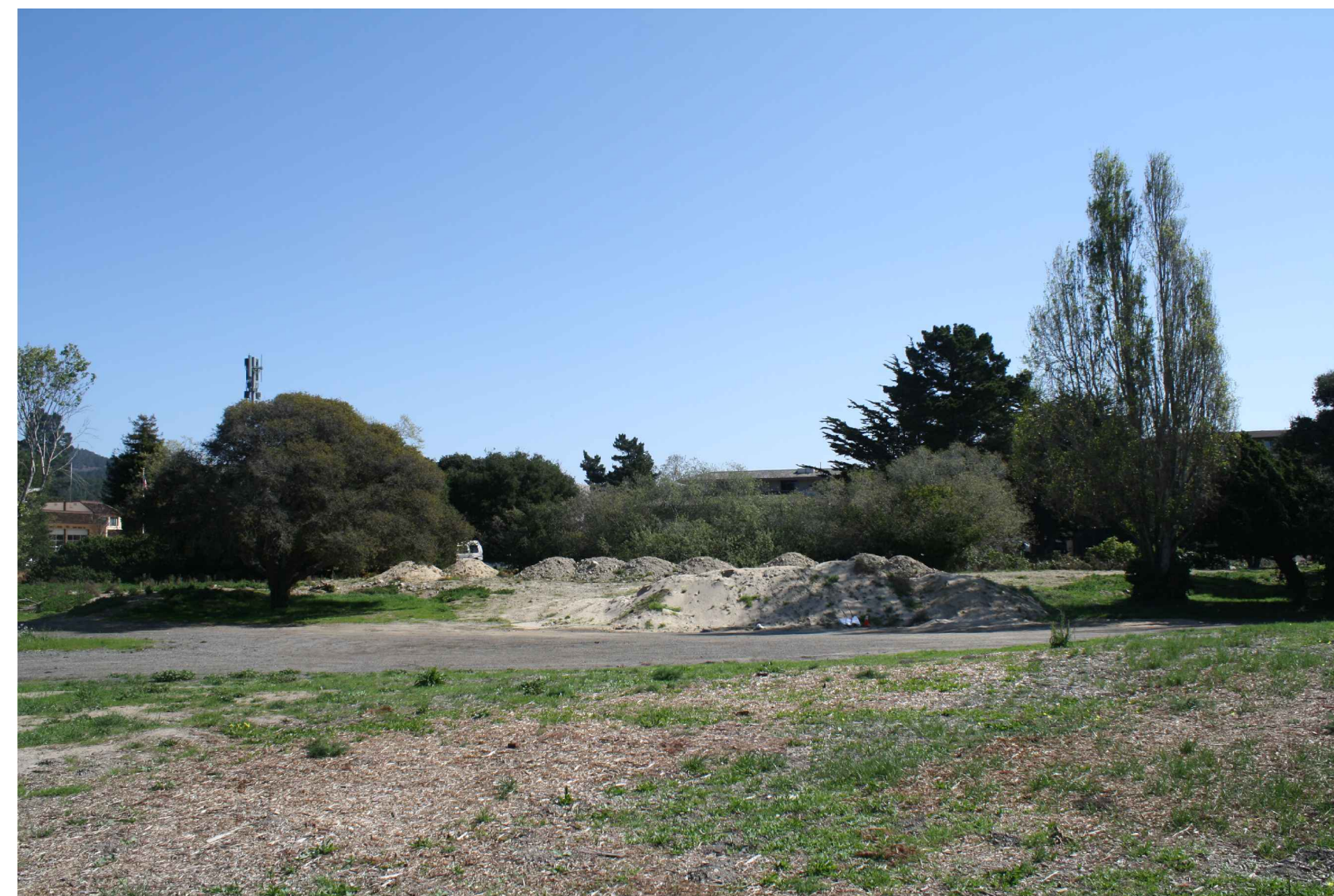
A-6 LOOKING EAST