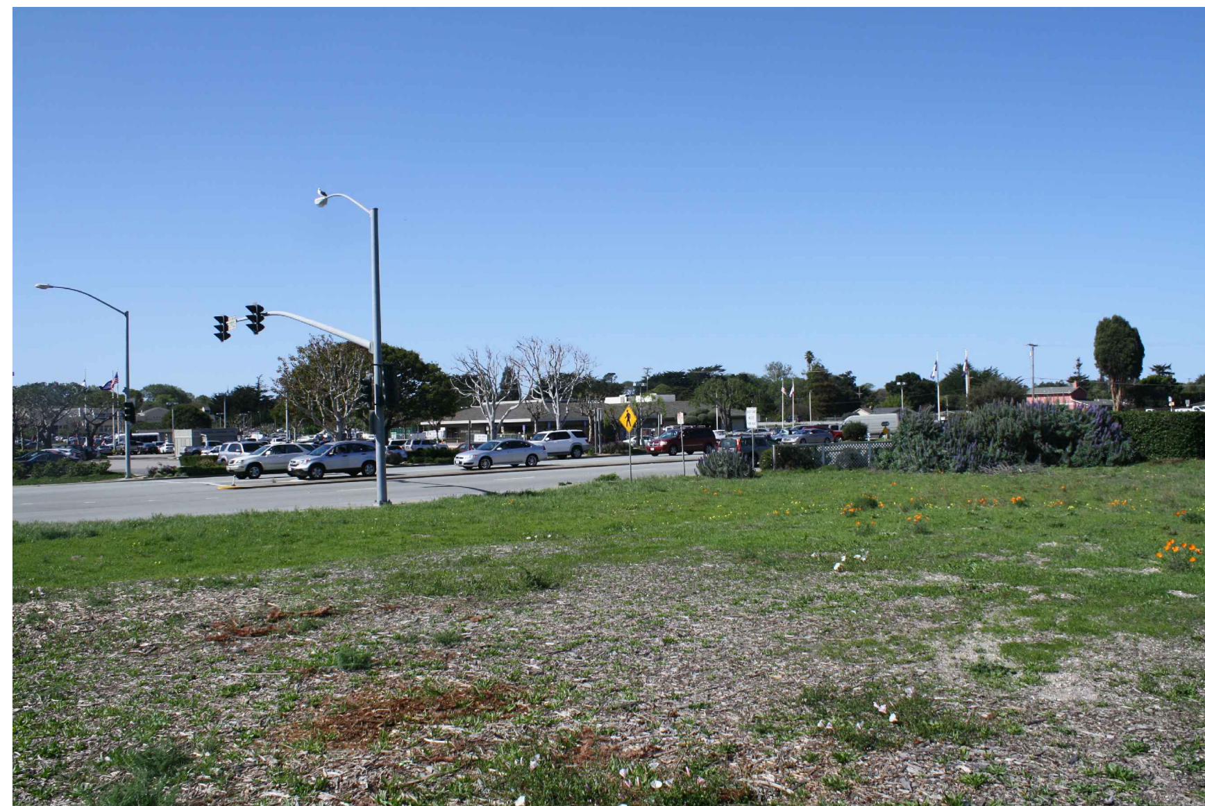
A-3 LOOKING SOUTHWEST