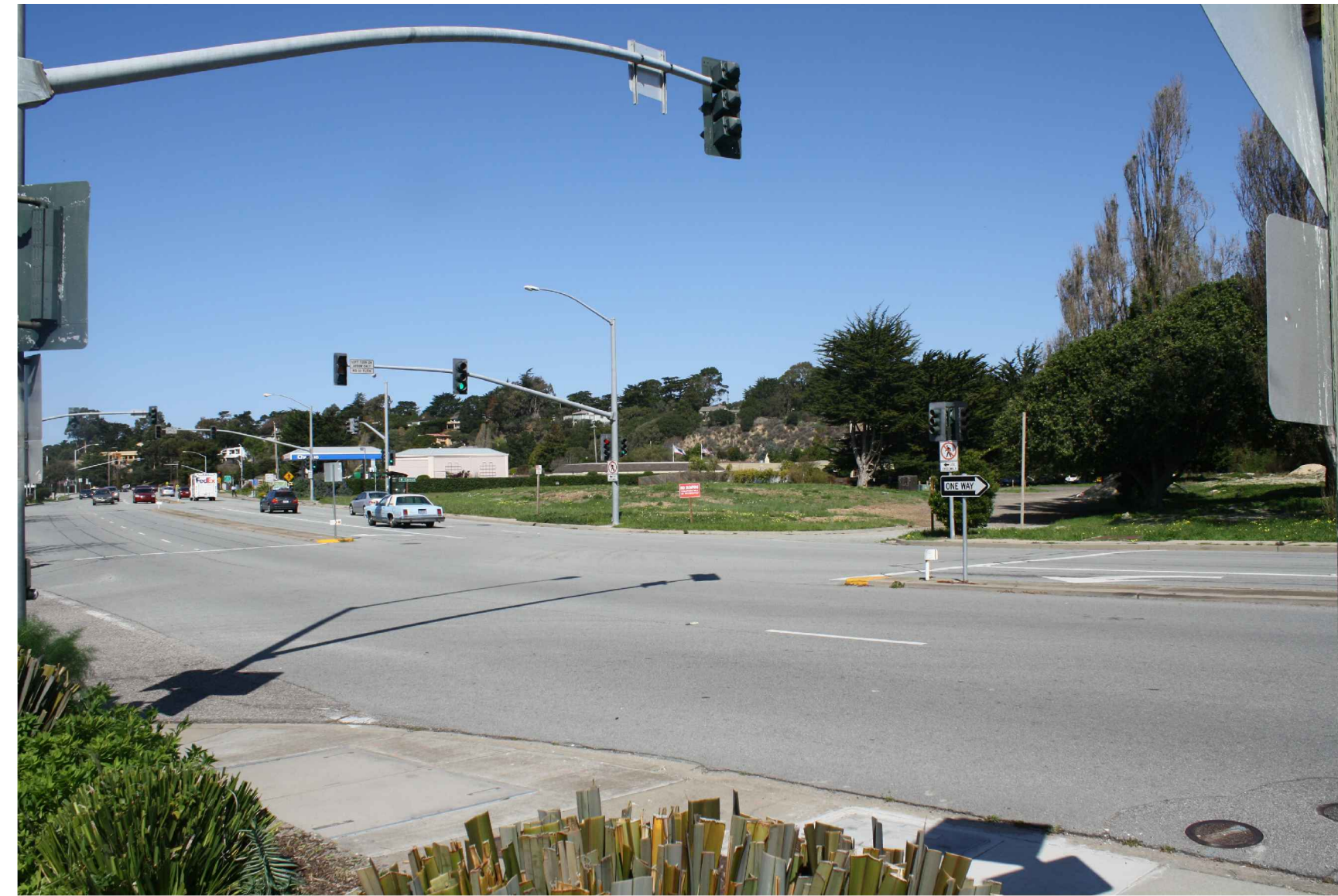
C - LOOKING NORTHWEST