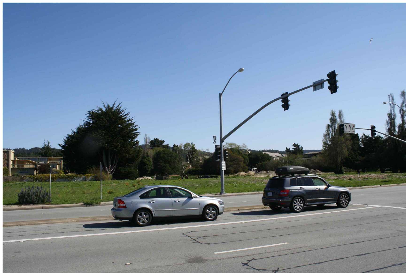
F-1 LOOKING NORTHEAST