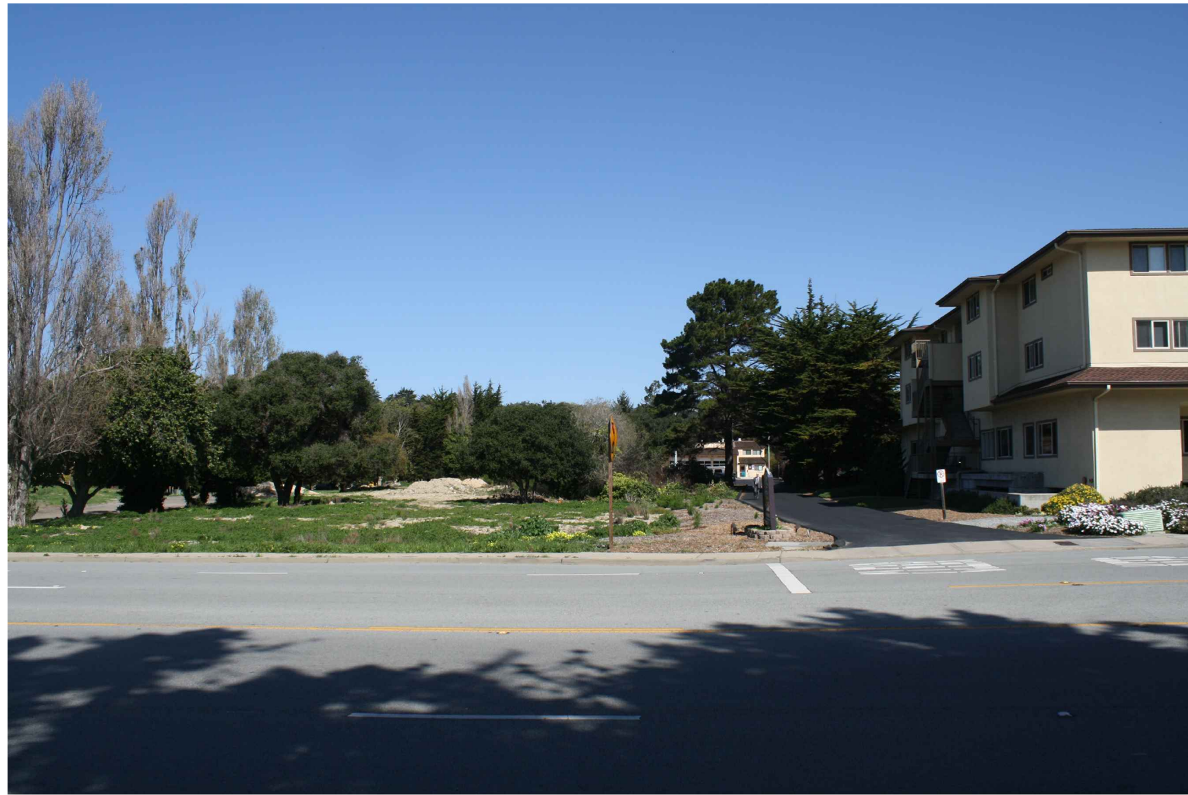
B - LOOKING NORTH