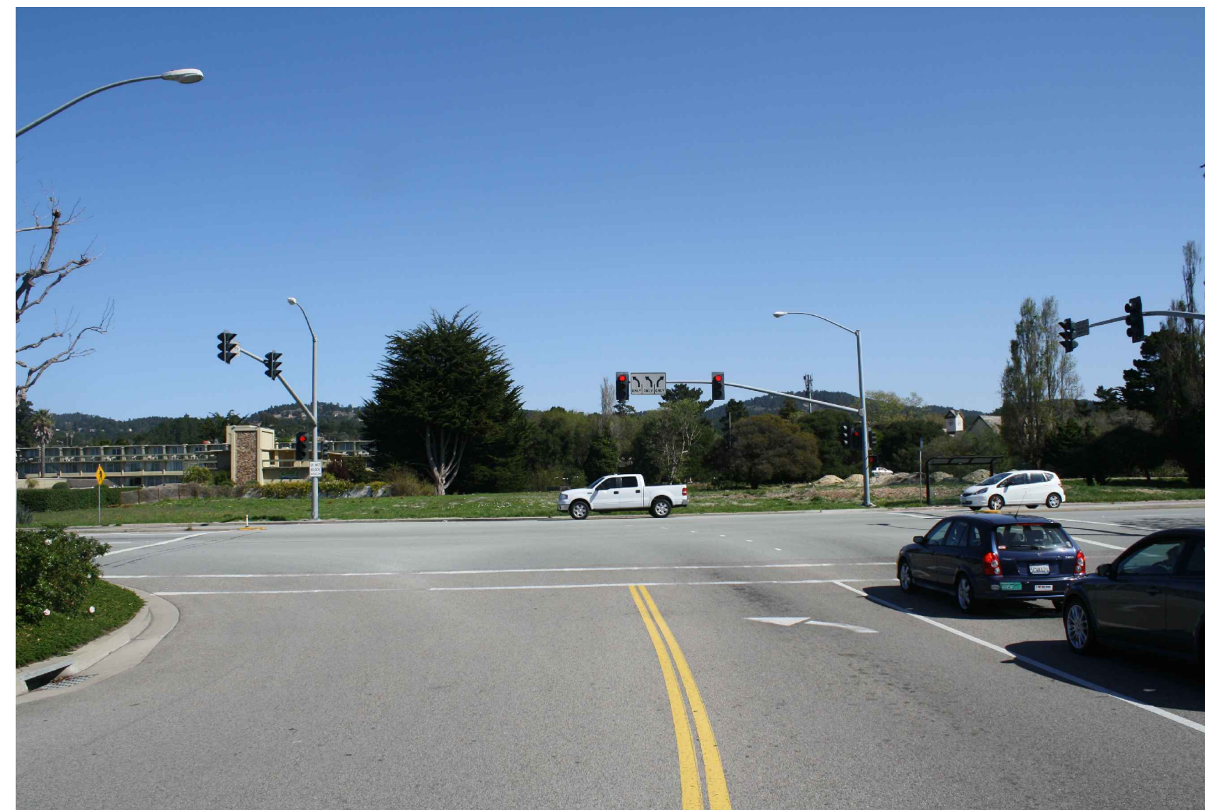
E - LOOKING NORTHEAST