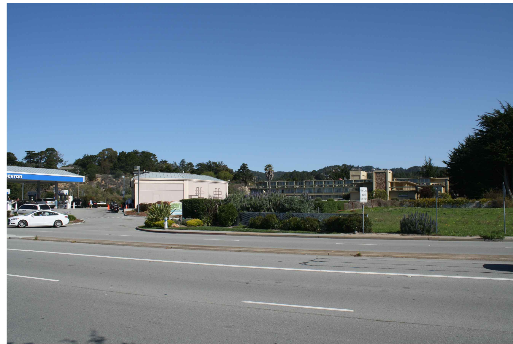
F-2 LOOKING NORTH