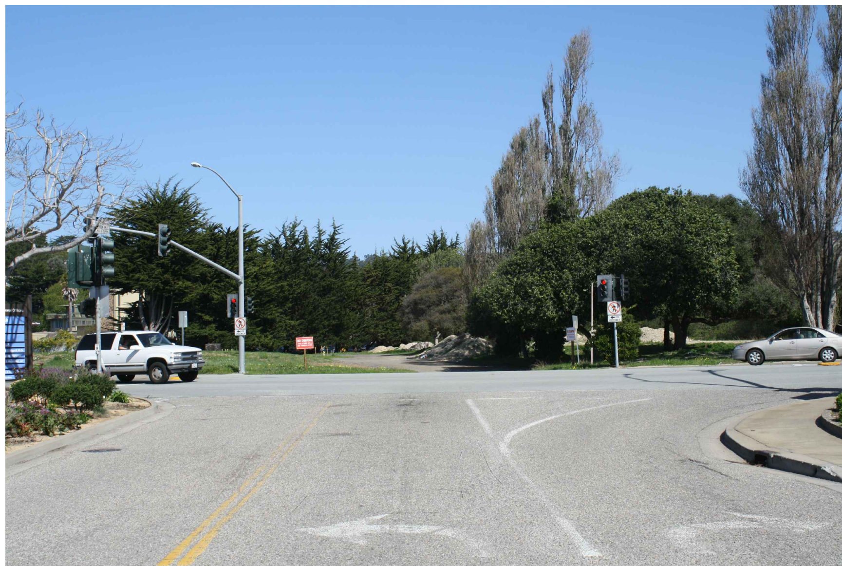
D - LOOKING NORTH