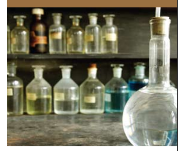
Pesticides typically contain several ingredients, any one of which may produce a sickening odor.

A breakdown product is the result of a chemical breaking apart into other chemicals. Some kinds of pesticides break down when exposed to sun or rain, or to bacteria found in soil. The breakdown is a natural process that may produce a compound that is more or less toxic than the original chemical. Many common pesticide breakdown products contain sulfur, which has a particularly bad smell.