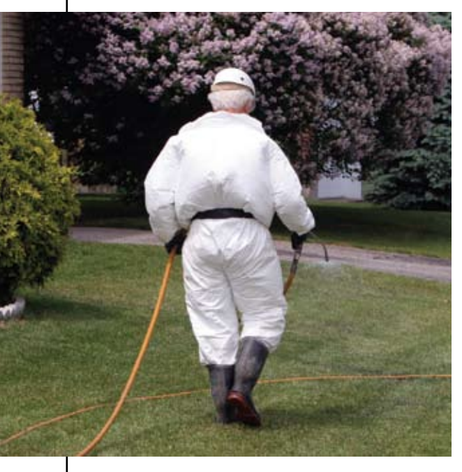
Drift can occur from residential and household pesticide applications, too. It can even happen indoors.

Because some drift can occur with any application (and may be in amounts too small to affect people or property), the laws focus on preventing substantial drift.