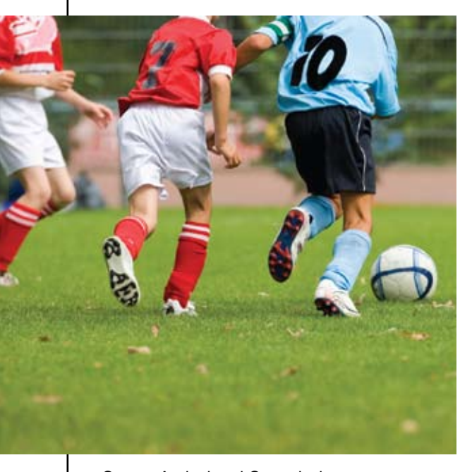
County Agricultural Commissioners can put additional restrictions on a farmer's use of restricted materials, for example, prohibiting the use of certain pesticides near playgrounds when children are likely to be present.

For pesticides classified as restricted materials, we may also suggest to the County Agricultural Commissioners that they put extra controls on how a product is used. These restrictions, designed to be part of the county permit to use the pesticide, can include buffer zones between the application site and places where people live, work, or play. Or an application may not be allowed when the weather increases the chance of odor problems, such as when it is hot, breezy, or there is a low-level inversion layer (a layer of warm air that keeps air under it still and close to the surface). The controls chosen depend on the application site, the particular chemical, and how it is usually applied.