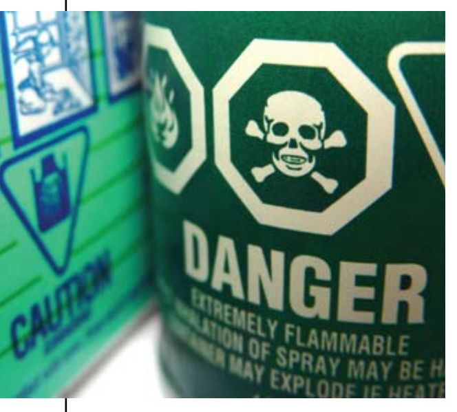
Product labels use three signal words, Danger , Warning or Caution to tell you the potential hazard of a pesticide. Read the label carefully to find out how to use the product safely.