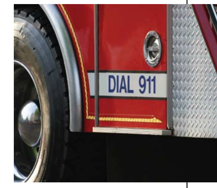
If pesticide drift is making people sick, call 911 right away.

We expect pesticides, when applied, to reach a specific target and remain there. That is the goal of all pesticide applications. Application equipment is built for that purpose. It's the focus of applicator training. When a pesticide product goes where it is not needed or wanted, it may endanger the safety and health of people, injure desirable plants and animals, and affect environmental quality.