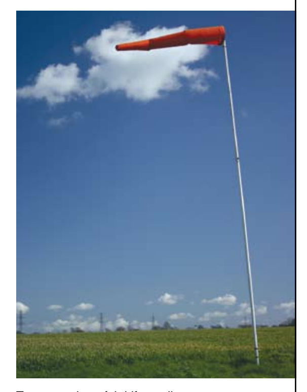
To prevent harmful drift, applicators must evaluate their equipment, the surrounding area, weather conditions, and anything else that may cause problems.

■ Must not make an application likely to result in harmful drift.