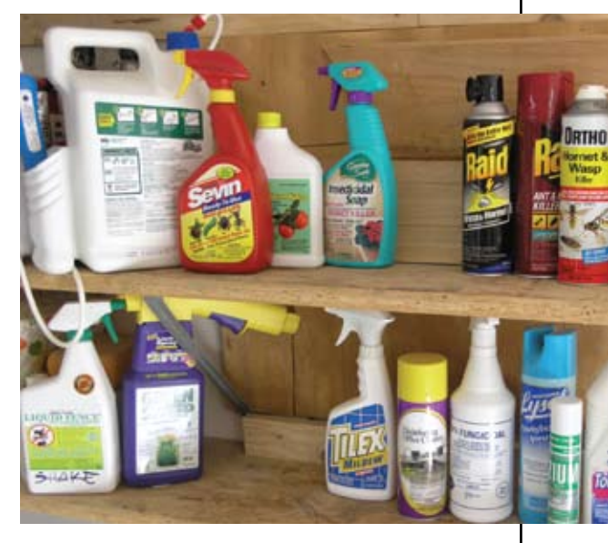
Bring the pesticide container with you when you go to the doctor. The information on the label will help with diagnosis and treatment.

If you are outdoors, move to where you can't smell the pesticide. You may need to move some distance away.