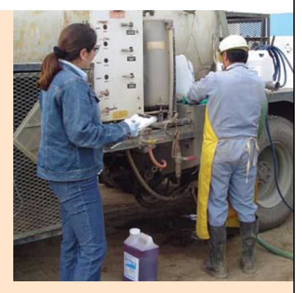
To investigate complaints, staff from the County Agricultural Commissioner's office will gather evidence to find out if pesticide laws were broken.

After the Agricultural Commissioner's staff complete their investigation, they prepare a report describing what occurred. If they found violations, they can also assess fines and other penalties. Agricultural Commissioners send their reports to DPR where scientists look for illness trends and potential problem areas. Scientists at DPR and the U.S. Environmental Protection Agency also rely on the information to improve use practices and safety information on pesticide labels.