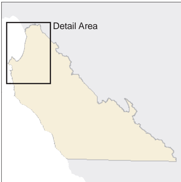
Exhibit 4.9-7 Land Use Conversion, 1982 - 2006 North County