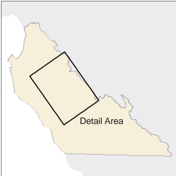
Exhibit 4.9-8 Land Use Conversion, 1982 - 2006 Salinas Valley North