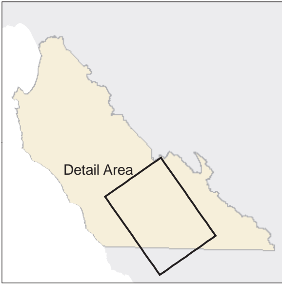
Exhibit 4.9-9 Land Use Conversion, 1982 - 2006 Salinas Valley South