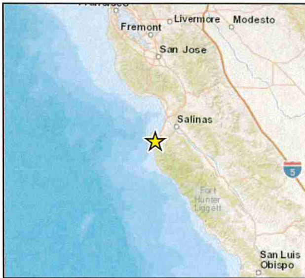
Figure 2. Vicinity Map