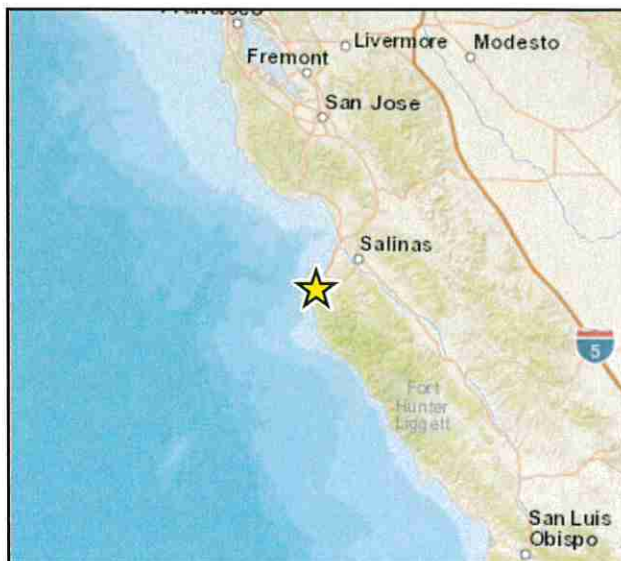
Figure 2. Vicinity Map