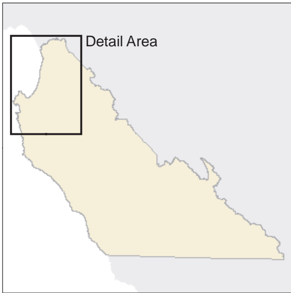
Exhibit 4.9-2 General Plan 2007 Plan Areas and Habitats North County