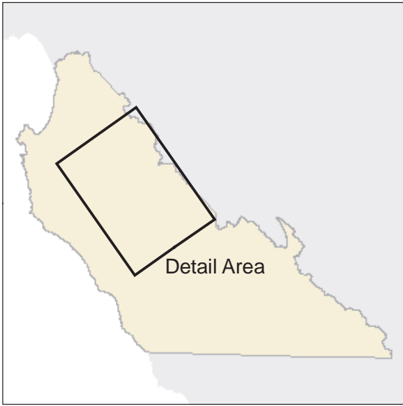
Exhibit 4.9-3 General Plan 2007 Plan Areas and Habitats Salinas Valley North