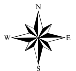
Figure # CA3