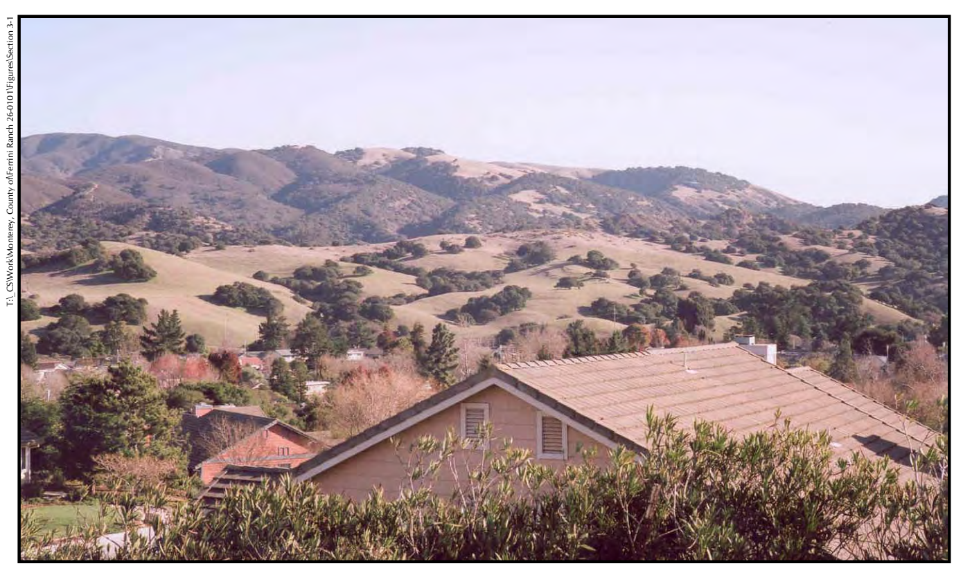
Figure 3.1-11a. Existing conditions as viewed from BLM public land looking south towards Lots #86 through #89, Lots #94, #95, #100, #101, Lots #104 through #115, Lots #117, #119, Lots #124 through #133, and Lot #137.