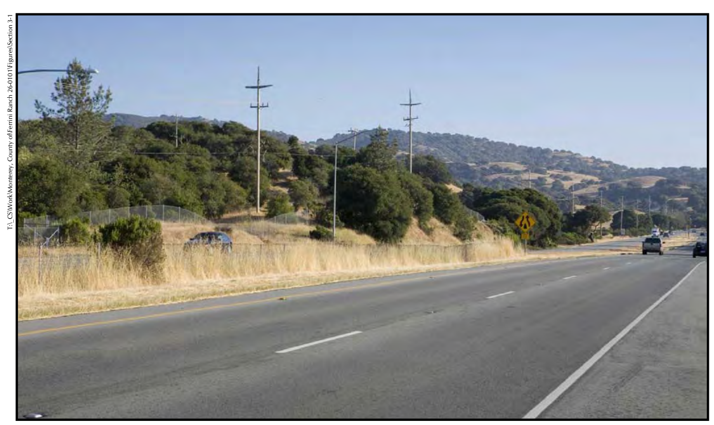
Figure 3.1-19a. Entrance Road (Westbound) - Existing Conditions