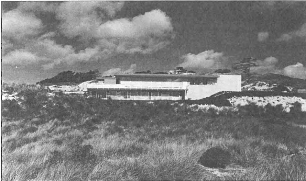
Figure C. Looking west from Signal Hill Road across northern section of house towards Cypress Point.