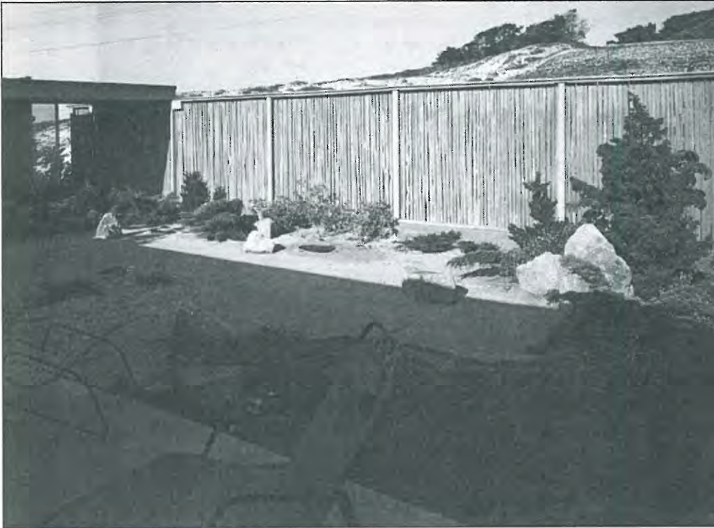
Figure D. Looking northeast across terrace and courtyard sand garden.

Paperwork Reduction Act Statement: This information is being collected for applications to the National Register of Historic Places to nominate properties for listing or determine eligibility for listing, to list properties, and to amend existing listings. Response to this request is required to obtain a benefit in accordance with the National Historic Preservation Act, as amended (16 U.S.C.460 et seq.).