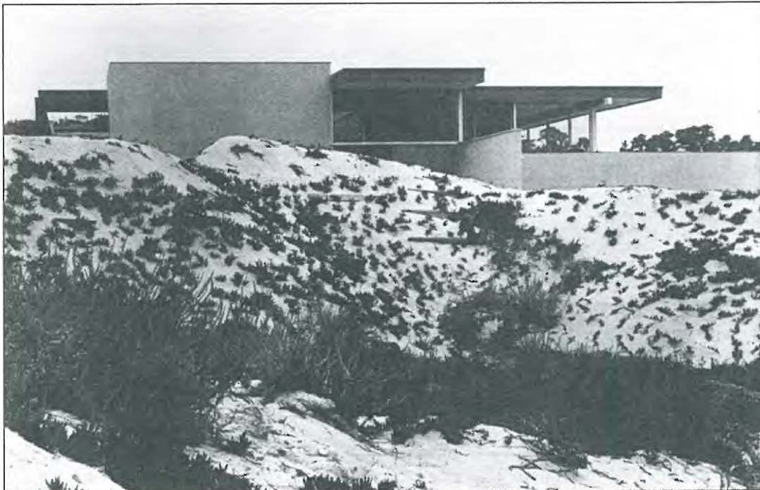
Figure A. Looking south at north elevation.