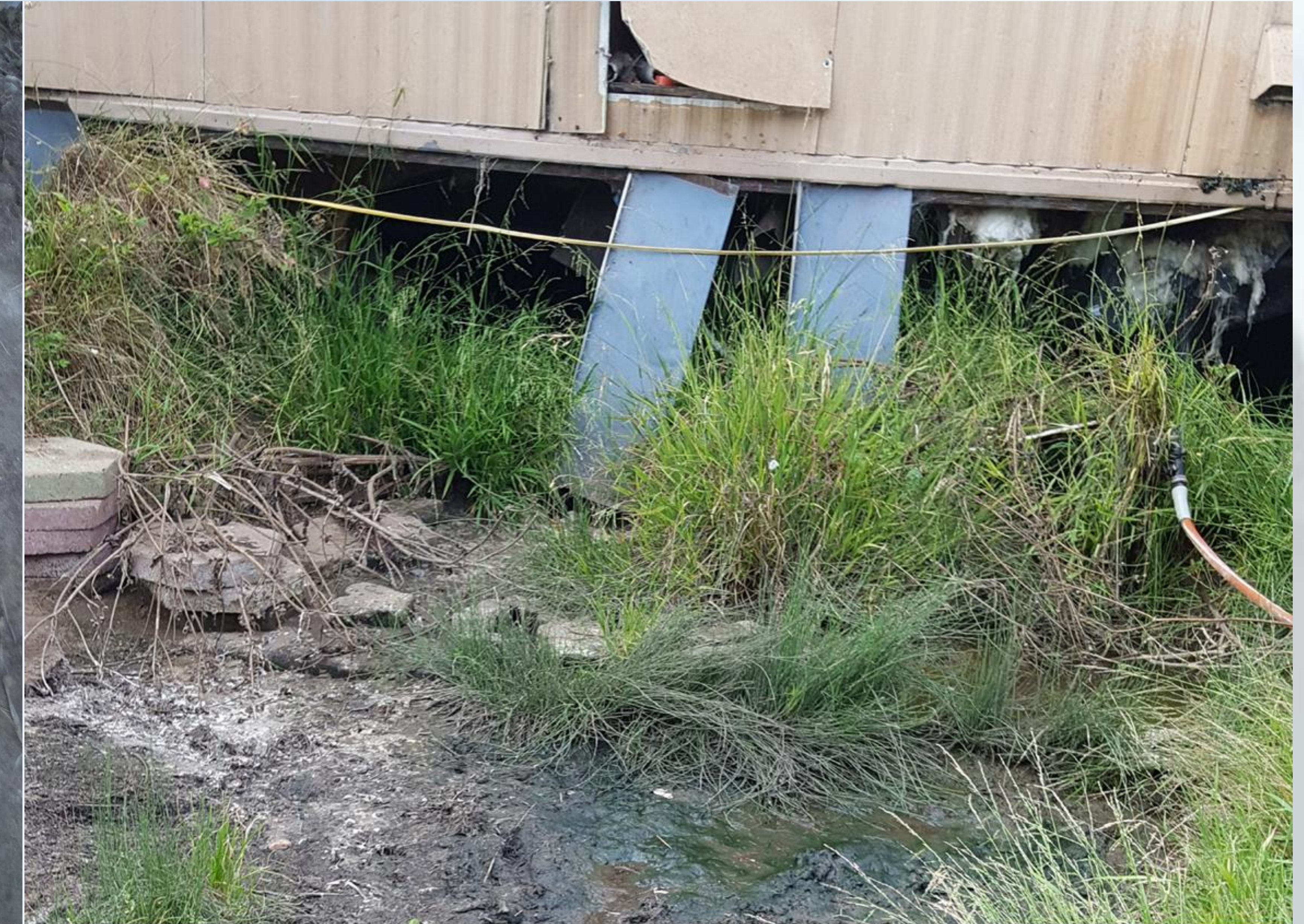
Septic Failure discovered during a W.S. (E. coli) Posting