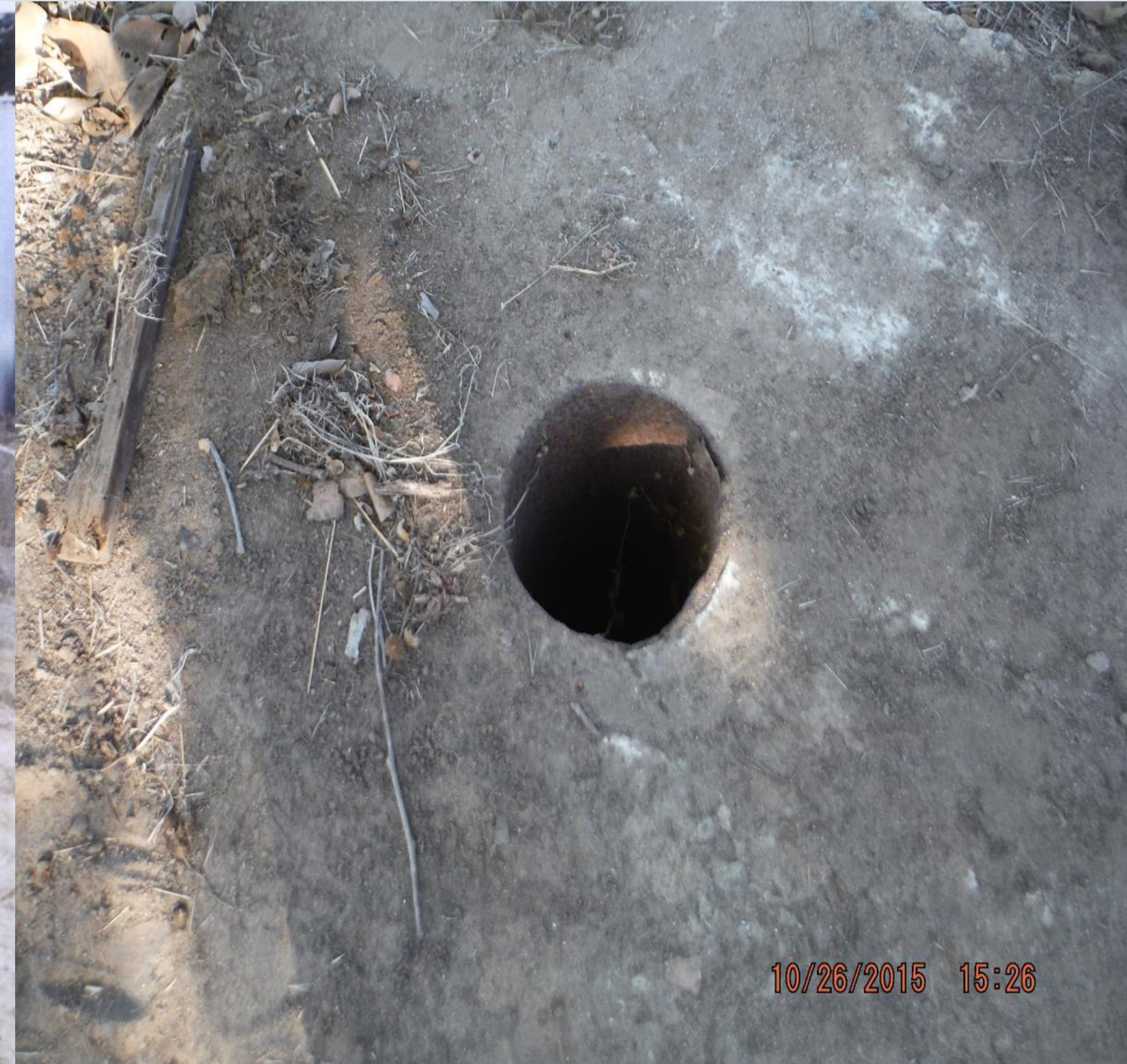
Open abandoned well