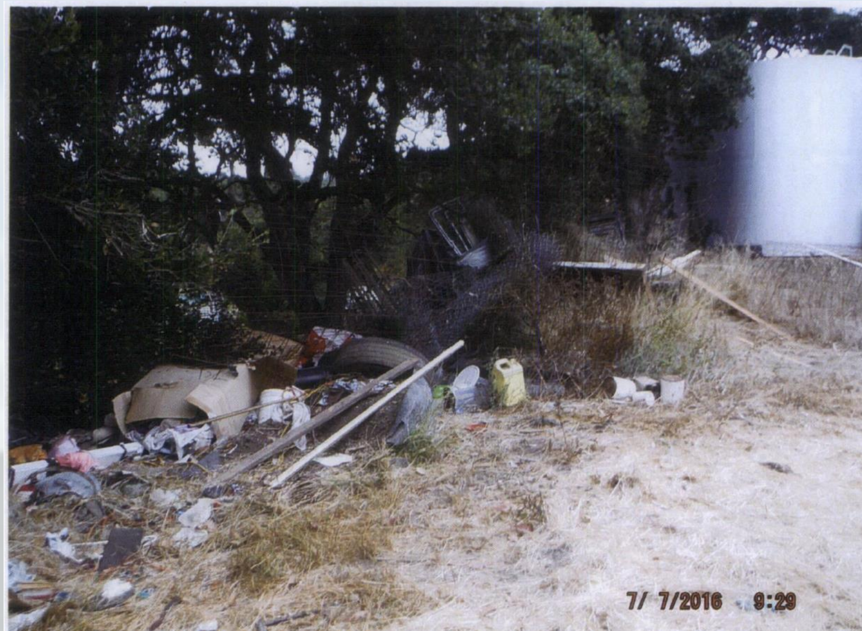
Trash and possible hazardous waste accumulation