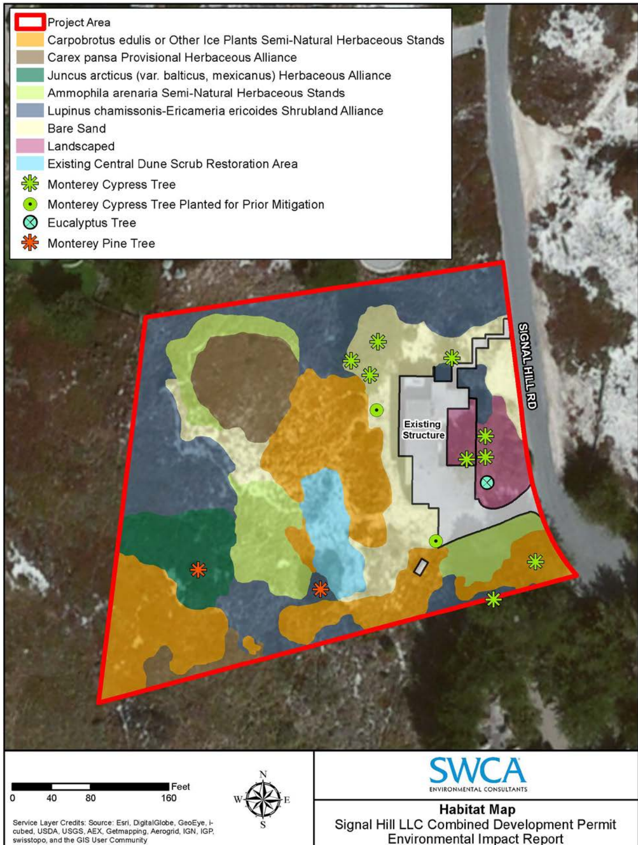
Figure 4.2-1. Habitat Map