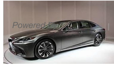
Discover The Six 2018 Luxury Cars That Are Under Faqeo