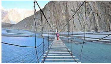
[Gallery] Only Brave Dare To Cross This Treacherous Daily Stuff