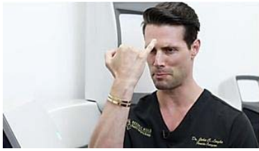
Plastic Surgeon Reveals: "You Can Fill In Wrinkles At Health Headlines