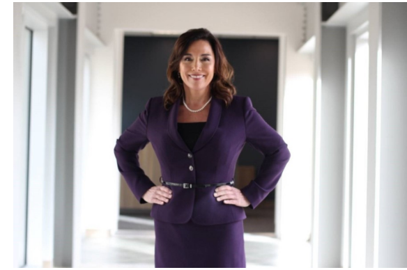
MONTEREY COUNTY DISTRICT ATTORNEY'S OFFICE JEANNINE M. PACIONI District Attorney

Assistance is limited to the amount of out-of-pocket expenses or bills incurred by or on behalf of the victim or applicant that have not been reimbursed by other sources such as insurance, and the amount of lost wages or loss of support (based on the victim's income) if that benefit is applicable. For applications filed on or after January 1, 2001, the maximum amount that can be reimbursed is $63,000. For applications filed on or after January 1, 2017, the maximum amount that can be reimbursed is $70,000.